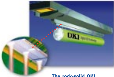
The rock-solid OKI Digital LED printhead utilizes a stationary array of pulsing light-emitting diodes (detail) to create high-resolution text and graphics.

Unlike lasers that print through a complicated array of rotating mirrors and moving parts, the OKI printing process uses flashing pinpoint beams of light that go straight to the photo-receptive image drum.